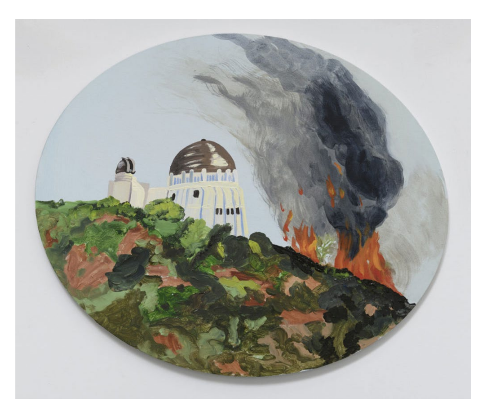
Susan Lizotte, Griffith Observatory Wildfire, 25 x 29, oil on canvas

I need to create and think my soul would be crushed if I couldn't. But I guess if being an artist was out of the picture (so to speak) I would want to move to Corsica and live in an ancient stone villa and grow grapes for wine.