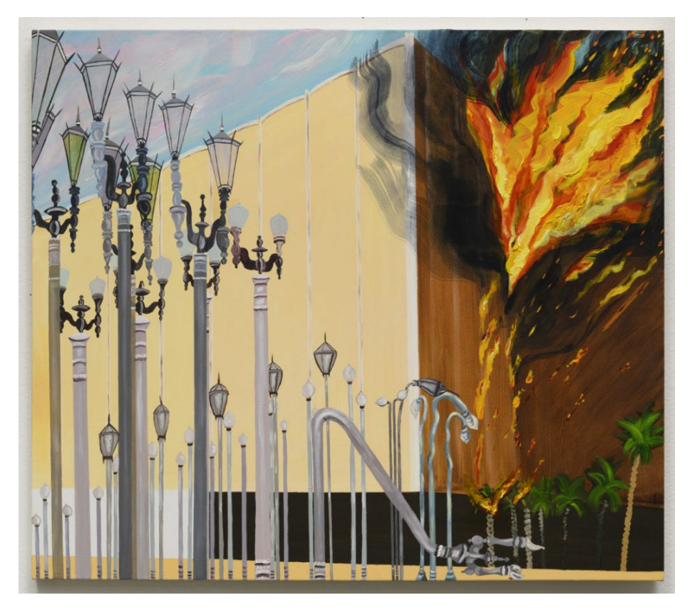
Susan Lizotte, LACMA Fire, 40 x 46, oil on canvas